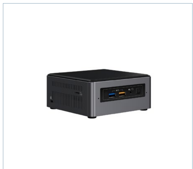
COM4SHIP® CCTV Server