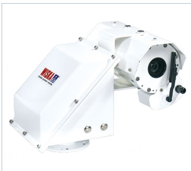
Camera CH-SW240 with pan & tilt unit FL6