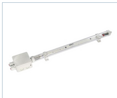
LED Multipurpose luminaires