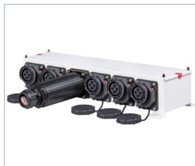
VARITAIN® Reefer container sockets