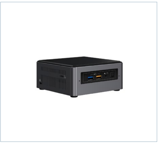
COM4SHIP® CCTV Server