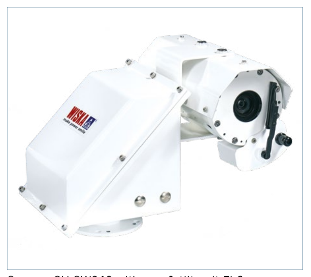
Camera CH-SW240 with pan & tilt unit FL6