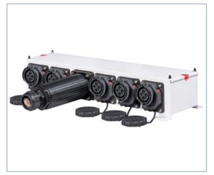
VARITAIN® Reefer container sockets