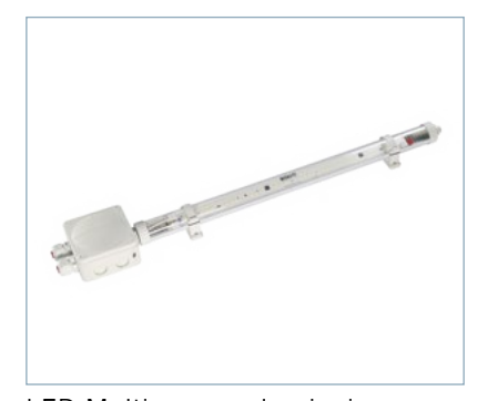
LED Multipurpose luminaires